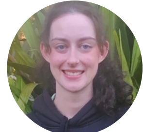
Armelle Research and Theory